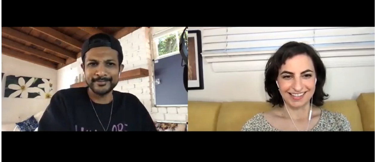
Utkarsh Ambudkar and Avital Ash